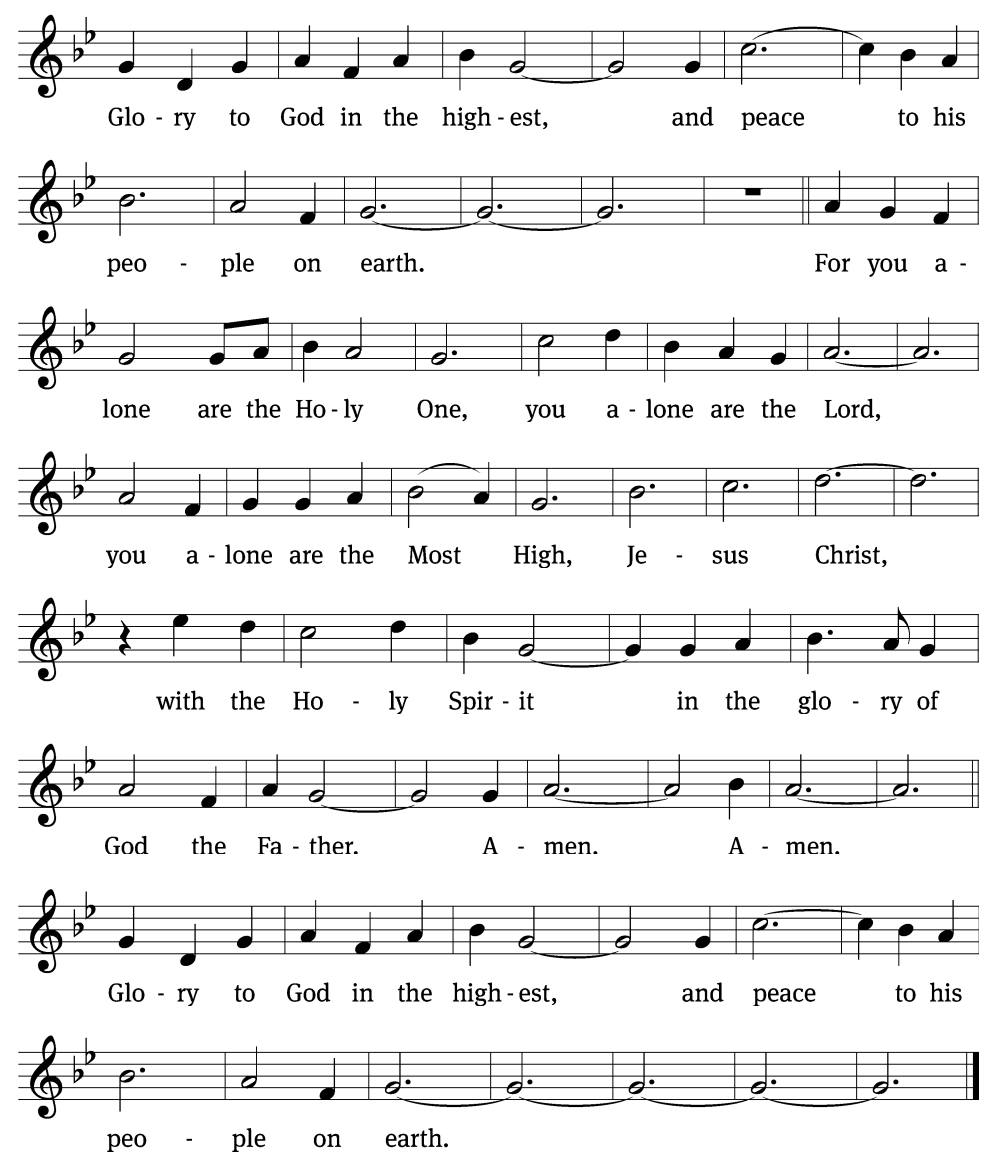
Tune: Marty Haugen

Tune: © 1984 GIA Publications, Inc. Used by permission: OneLicense no. 703838