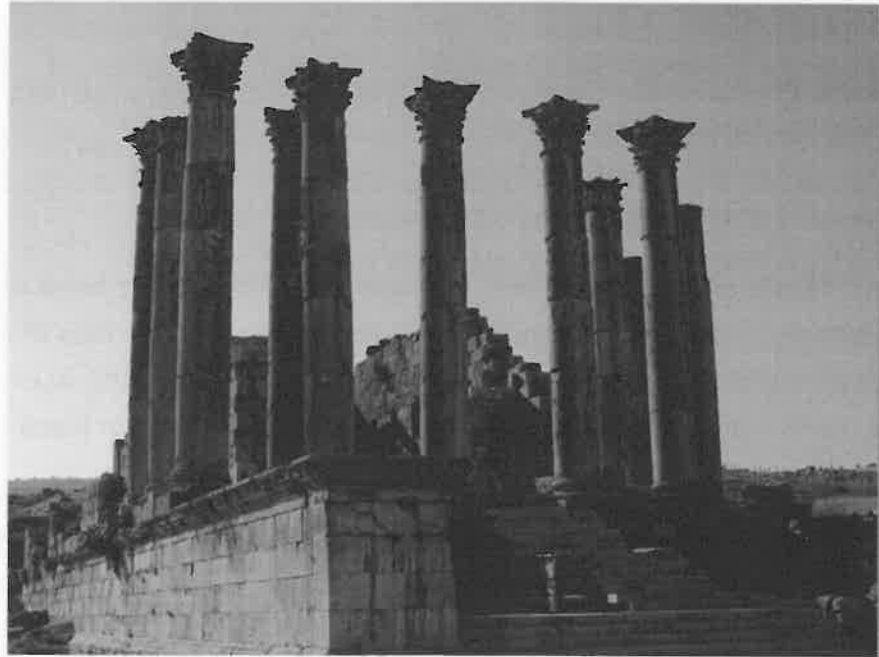
Temple of Artemis at Ephesus

So they got the whole city together in their vast theater. They accused Paul of hating their goddess, ruining their city. Whenever anyone tried to explain, they would just shout, "Great is Artemis of the Ephesians! Great is Artemis of the Ephesians!" Can you imagine being a witness for Jesus on that stage?